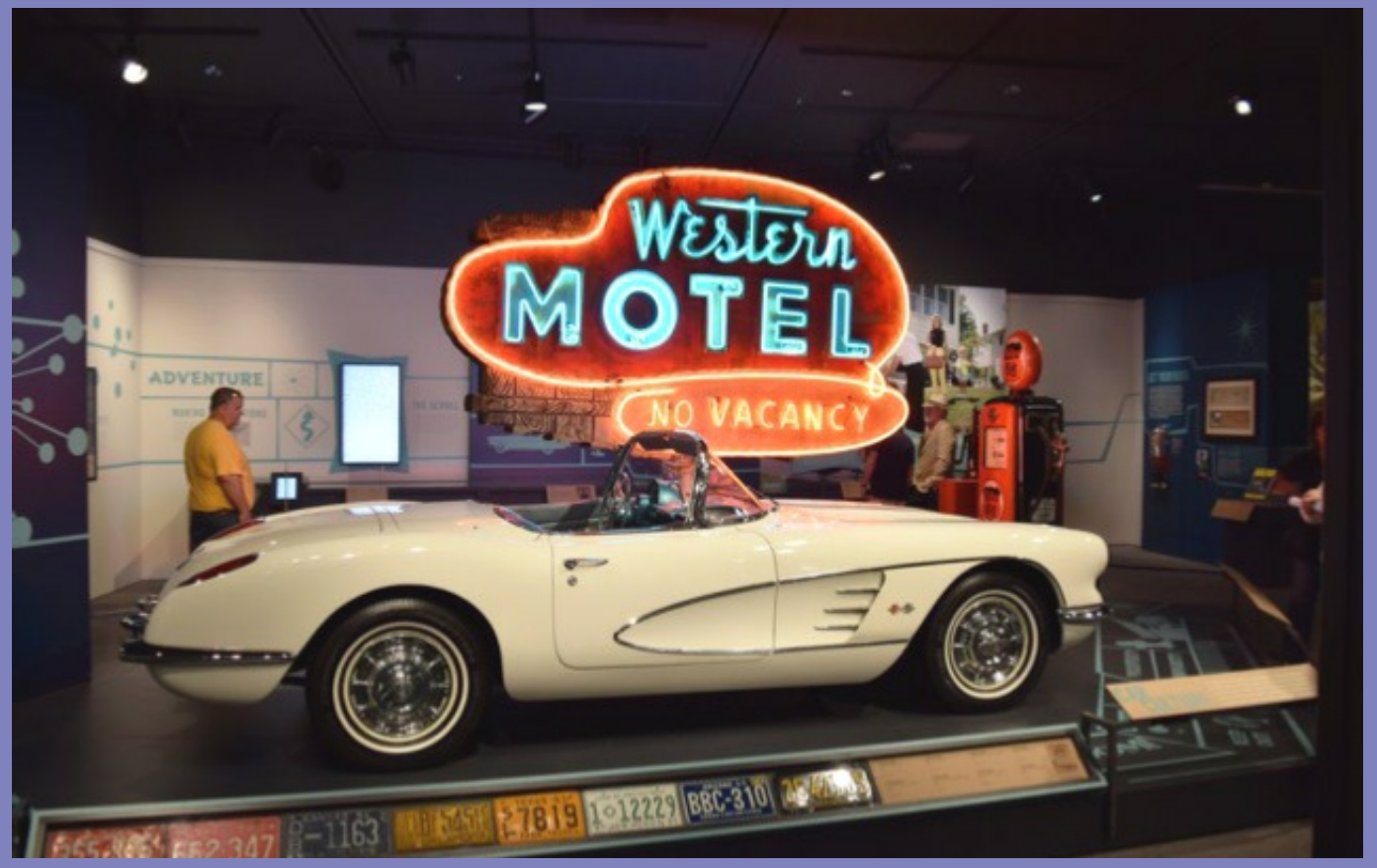
Part of the Route 66 display at The Autry National Center in Los Angeles.